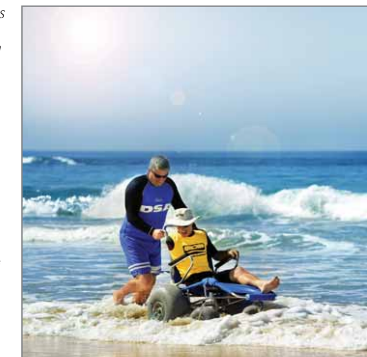
Surf, sun and sand can now be enjoyed thanks to advances in technology displayed in the FreeWheeler

Also a big thank you to Cricket NSW and the Dockside Group, which as sponsors made possible the 13th Annual Cricket Legends Lunch.