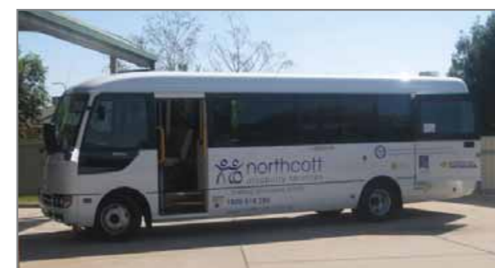
Clients to access the community thanks to new bus

The Riverina bus is made available thanks to the support of Northcott's Fundraising Committee in Wagga Wagga, as well as Wollundry Rotary Club,