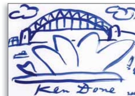
Ken Done artwork to be auctioned at the Celebrity Doodle Auction

Enjoy a cocktail night at Northcott's second Celebrity Doodle Auction which has already received artwork from the likes of Olivia Newtown John, Ken Done, Lee Kernaghan, Gai Waterhouse and more.