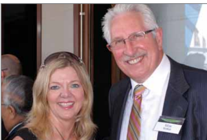
[L to R] Kerry Chikarovski and Max Walker